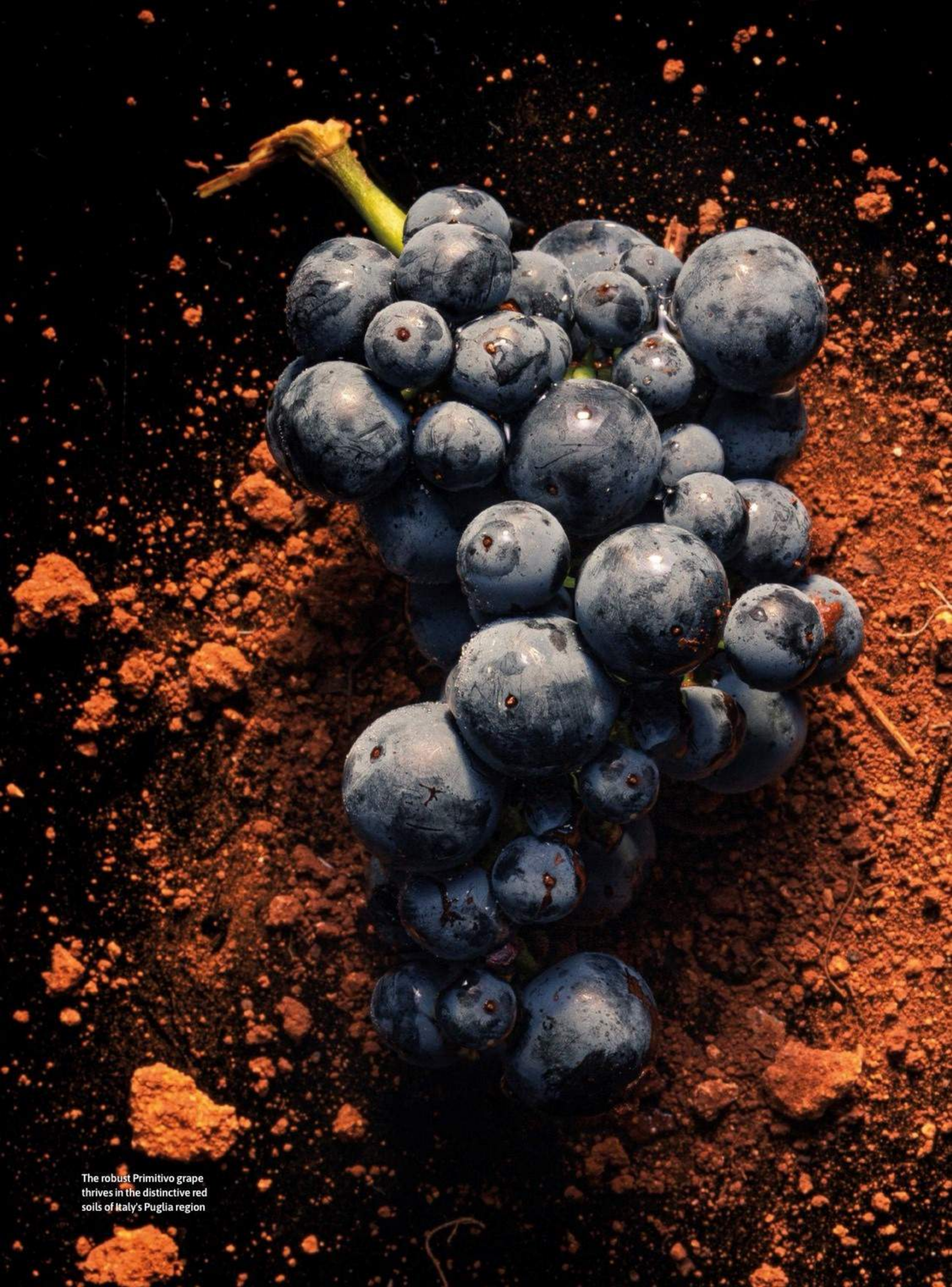
The robust Primitivo grape thrives in the distinctive red soils of Italy's Puglia region